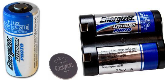
Figure 1 - Example of Lithium Metal Cells and Batteries

Lithium-ion batteries (sometimes abbreviated Li-ion batteries) are a secondary (rechargeable) battery where the lithium is only present in an ionic form in the electrolyte. Also included within the category of lithium-ion batteries are lithium polymer batteries. Lithium-ion batteries are generally used to power devices such as mobile telephones, laptop computers, tablets, power tools and e-bikes.