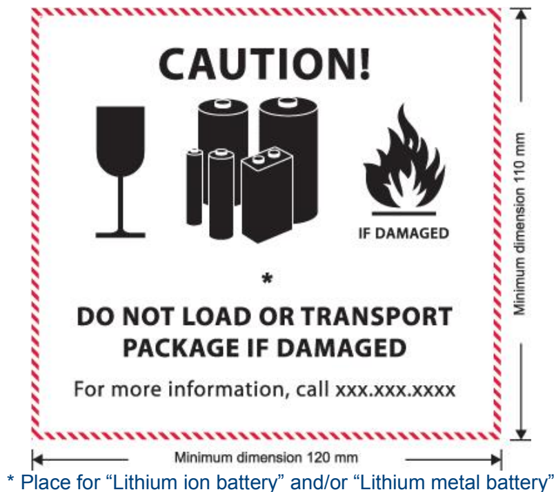
Figure 2 – Lithium Battery Handling Label

Where the packages are of dimensions such that they cannot bear the full size lithium battery mark, the mark dimensions may be reduced to 105 mm wide x 74 mm high. The design specifications otherwise remain the same.