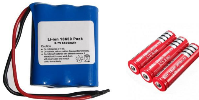
Figure 2 - Example of Lithium Ion Cells and Batteries

Lithium-ion batteries (sometimes abbreviated Li-ion batteries) are a secondary (rechargeable) battery where the lithium is only present in an ionic form in the electrolyte. Also included within the category of lithium-ion batteries are lithium polymer batteries. Lithium-ion batteries are generally used to power devices such as mobile telephones, laptop computers, tablets, power tools and e-bikes.